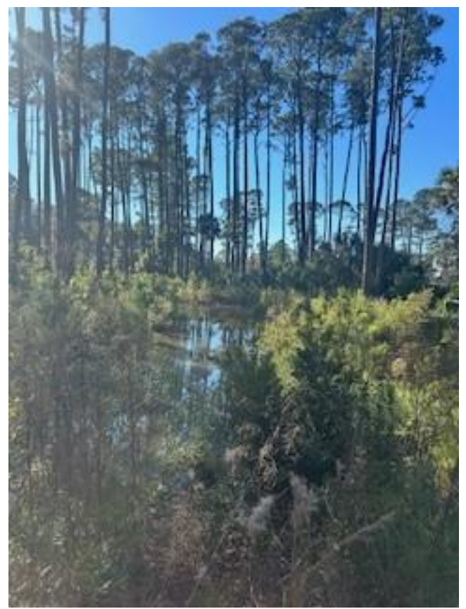
Figure 1. Maritime Forest and Channel Currently Located at Site of Proposed Development

At this site location, we observed the existing land alterations that have already taken place to stage equipment for the Cape. We also identified the locations of buildings that were removed to allow for additional parking on-site and an existing channel that is planned to become the main drainage feature for the development ( Figure 1 ).